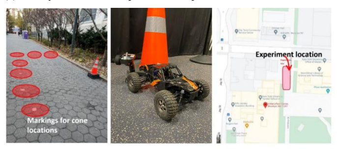
(b) Markings to guide participants for placement of traffic cones, an image of the model car, and the location of the experiment site

(a) Bird eye view of the experiment setup