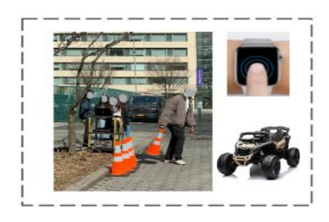
(b) Real world user study setup