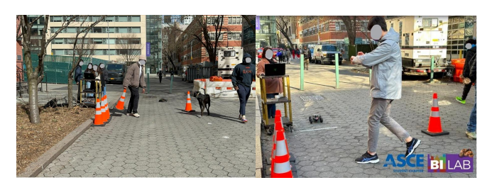
Figure 3. Behavioral data collection in the real-world scenario: Participant picks up cones to create the mobile work zone(left); participant reacts to alarms from a wearable device.